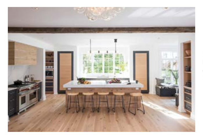
Everest supplied Karp TOH kitchen with island and counters in Ramses from Enigma Surfaces