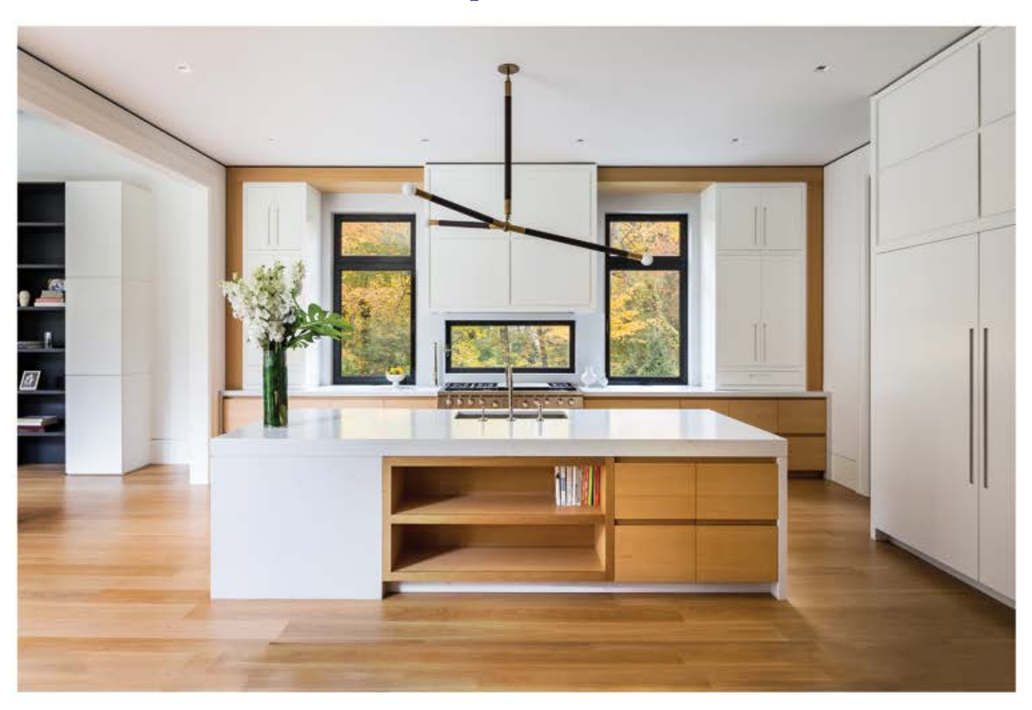
Giza Enigma Surfaces supplied by Everest Marble