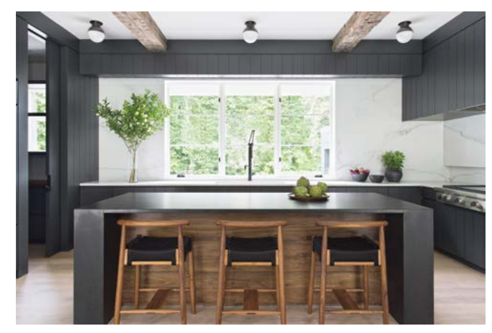
Keith Manca Greenwich custom home kitchen with Lido 3cm granite island from Everest Marble