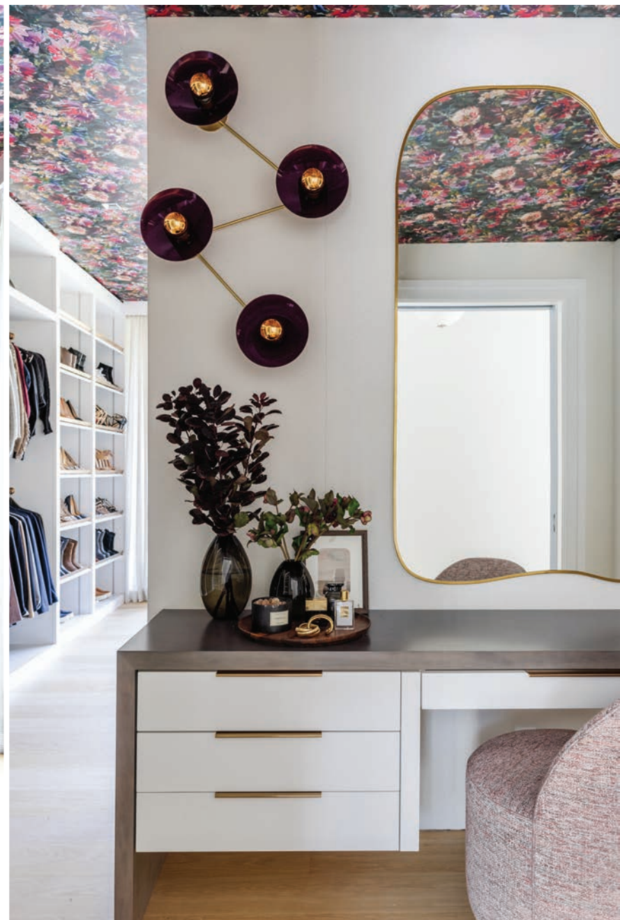
left: The wife's dressing room is unabashedly feminine, with Clarke & Clarke Exotica wallpaper and a custom ottoman. right: In addition to the expansive closet space, Hirsch created a vanity setup for the client.