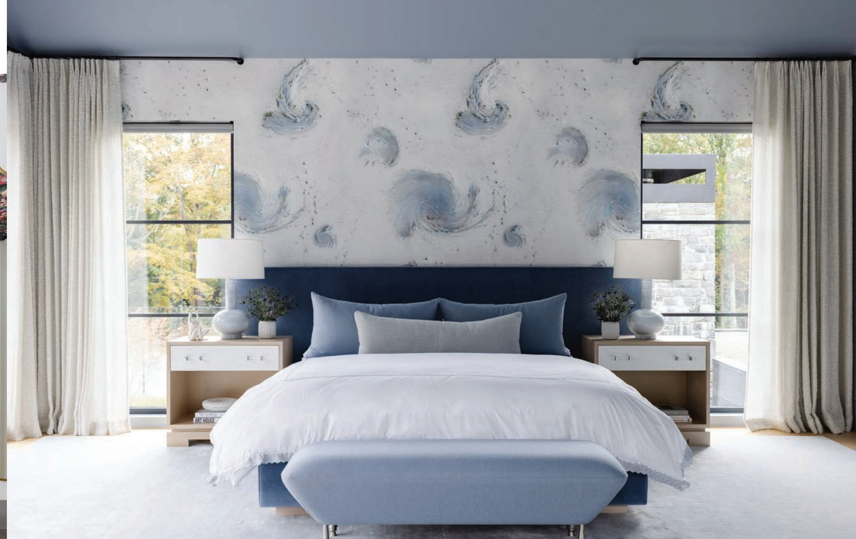
above: The primary bedroom is still colorful, but calm, with soft blues picked up from the Trove Noctis printed wallcovering. below, left: Hirsch found the Lilac slabs at Norwalk's Everest Marble. below, right: A freestanding soaking tub anchors the serene bathroom space.