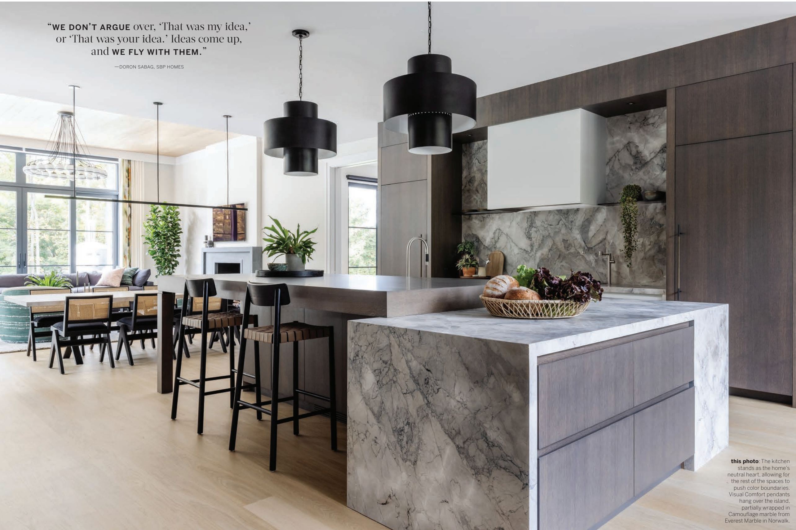
this photo: The kitchen stands as the home’s neutral heart, allowing for the rest of the spaces to push color boundaries. Visual Comfort pendants hang over the island, partially wrapped in Camouflage marble from Everest Marble in Norwalk.