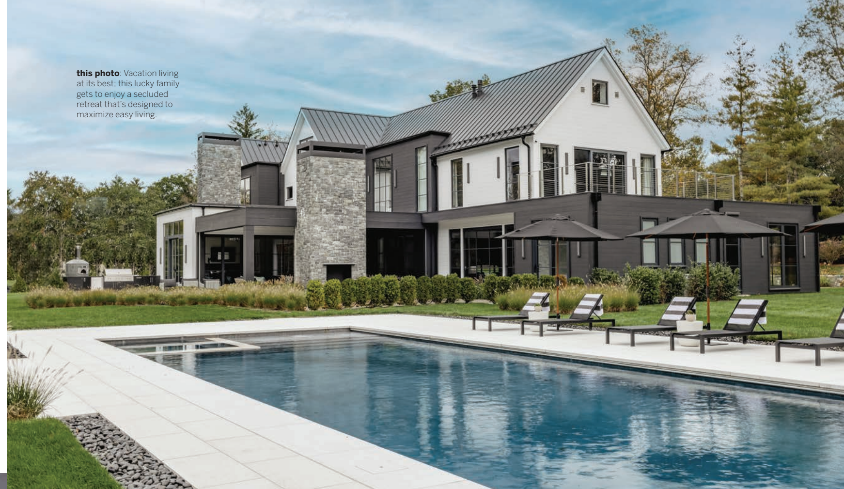
this photo: Vacation living at its best; this lucky family gets to enjoy a secluded retreat that's designed to maximize easy living.