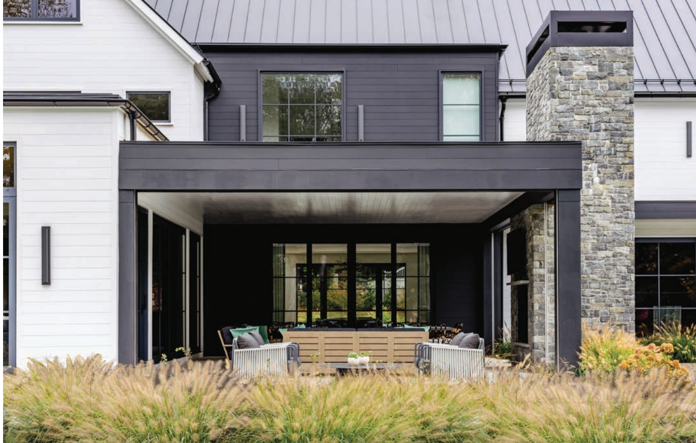
above: Sabag loves creating these exterior rooms for clients, perfect for warm-weather lounging. below: Family and friends can gather around the outdoor dining table or settle into the RH sofas.