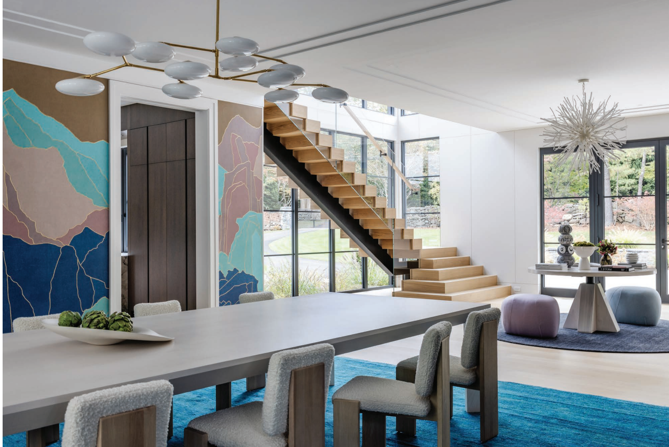
above: The Visual Comfort fixture is just one of many statement lighting choices throughout the home. above, left: Fromental's Rockface wallpaper in the El Capitan colorway became a jumping-off point for the palette. Cuff Studio C back chairs in deep sea green anchor the table. below, left: A view from the dining table peeks into mudroom storage.

“I was DYING TO USE THE FROMENTAL WALLPAPER. That became the central force to the whole thing. IT’S SO IMPACTFUL, and it ALLOWED US TO SPRINGBOARD off from there.”