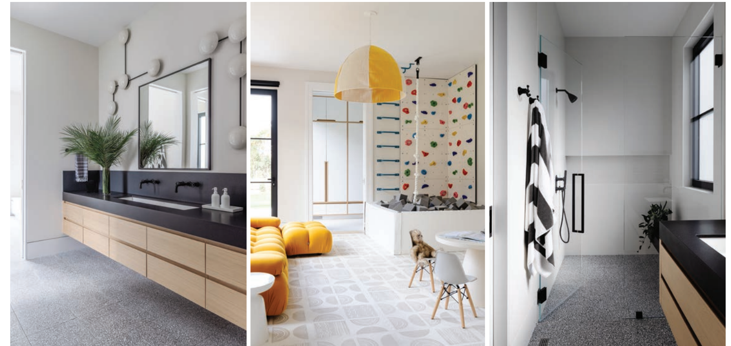
top, left: Arteriors Glaze sculptural sconces frame the mirror in this bathroom. top, middle: A custom Bone Simple pendant adds a playful touch to this kids' space. Mat flooring from House of Noa provides extra cushion for soft landings. top, right: Hirsch found the black and white Terrazzo pieces at Greenwich Tile. below: This boy's room gets Lindsay Cowles Alta wallpaper on the ceiling and drapery made with Élitis' Horizon in Flânerie—one of Hirsch's favorite fabrics.