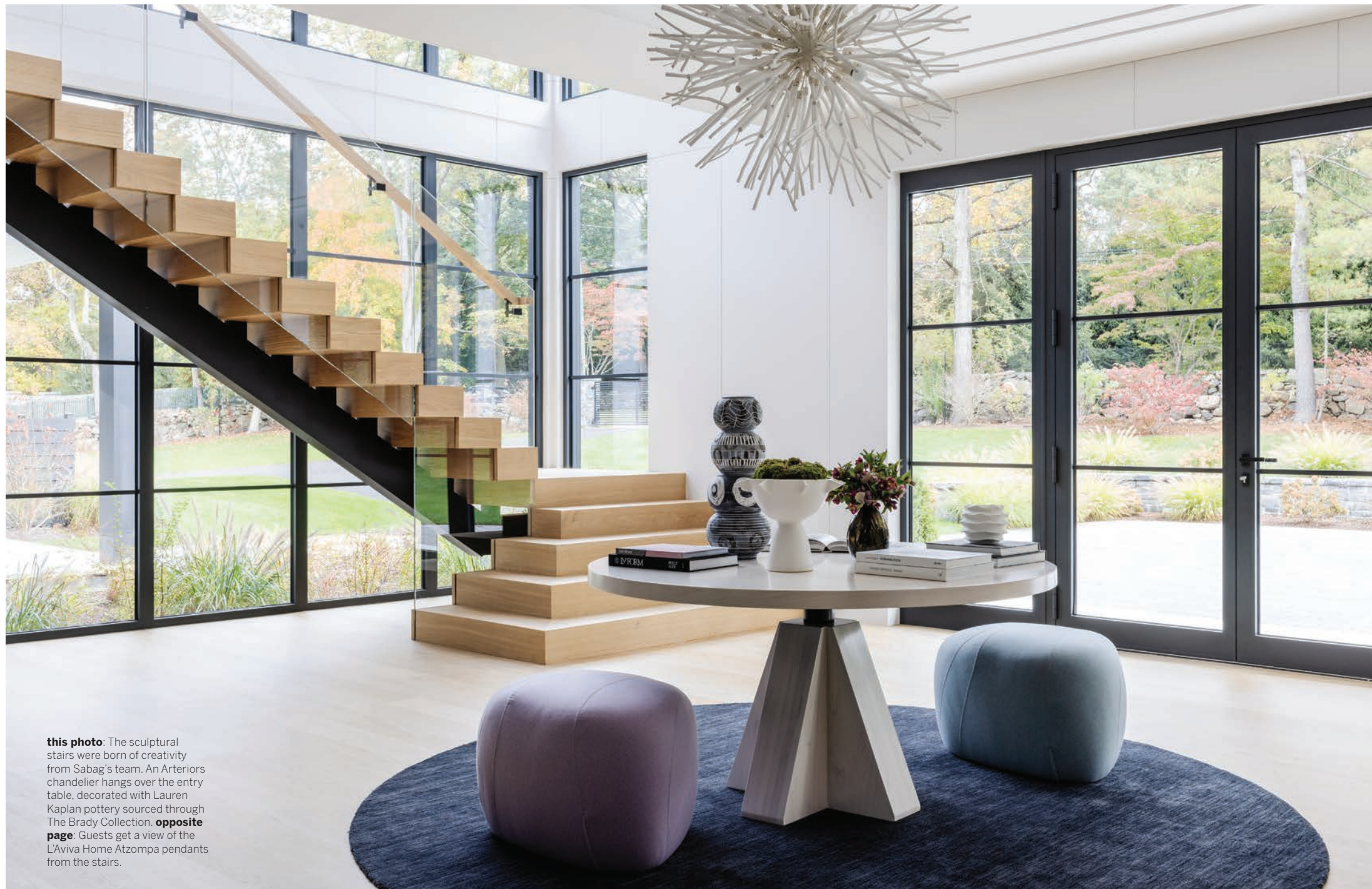
this photo: The sculptural stairs were born of creativity from Sabag's team. An Arteriors chandelier hangs over the entry table, decorated with Lauren Kaplan pottery sourced through The Brady Collection. opposite page: Guests get a view of the L'Aviva Home Atzompa pendants from the stairs.